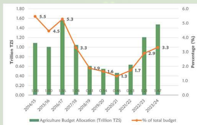
Figure 1: Trends in Share of Agriculture Sector Budget Against Total National Budget, from FY 2014/15 to 2023/24 1 .

Despite the significant increase in budget allocation to the agriculture sector from about TZS 456.7 billion in 2021/22 to TZS 1.47 trillion in 2023/24 depicted in Figure 1, the country is yet to allocate sufficient resources as committed in the Maputo Declaration of 2003 (later reaffirmed under the Malabo Declaration of 2014) whereby African nations agreed to invest at least 10% of their budgets to agriculture to attain a 6% growth rate by 2025. Low public investment in the sector translates into food and nutrition insecurity, abject poverty due to low income and economic growth.