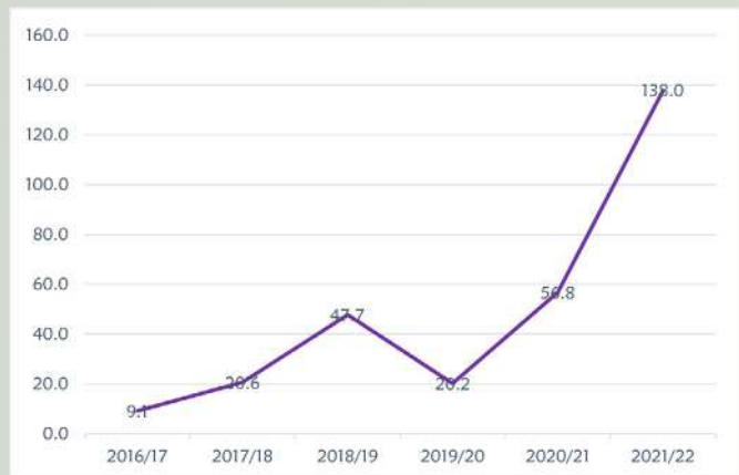
Figure 3: Agriculture Sector Disbursement Rate for Development Expenditure against Approved Budget from 2016/17 to 2021/22

Cooperatives Development Commission (TCDC) until 2022/23 as outlined in Figure 4.